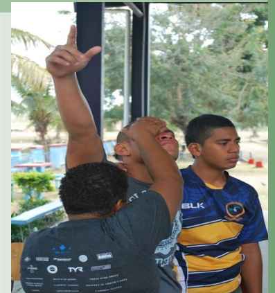
Empowered and Set Free, Young people praying for each other at a recent camp.