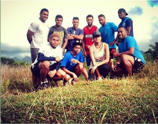
Suva volunteers took time out to climb Mt Korobaba for a time of fellowship and prayer earlier this month.