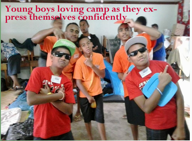
Young boys loving camp as they express themselves confidently