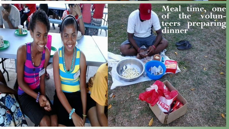
Meal time, one of the volunteers preparing dinner

"Children are great imitators. So give them something great to imitate." Anonymous