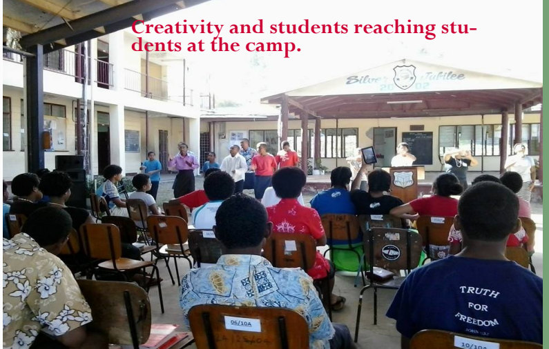
Creativity and students reaching students at the camp.