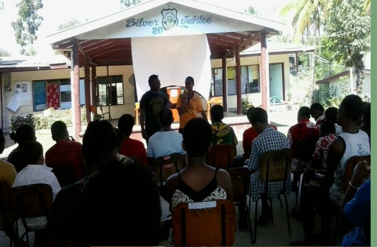
Sharing of the Word were powerful reflection times