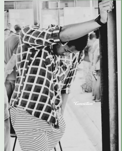
A young man surrenders his life to Jesus at the recent Nadi SU Camp