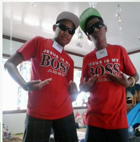
Young Boys showing whose boss at the Western Division Term 2 Camp held at Mulomulo Secondary School in Nadi.