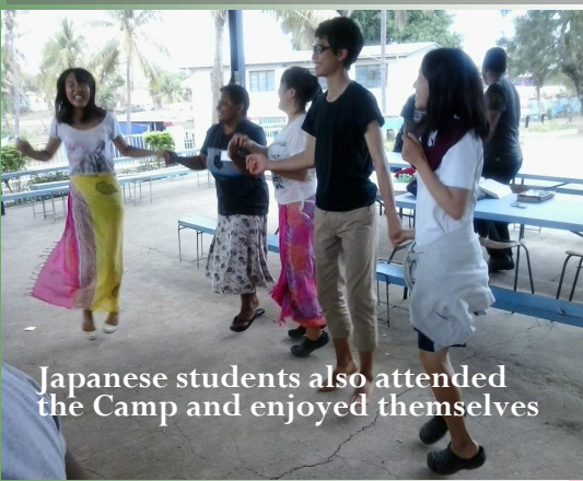
Japanese students also attended the Camp and enjoyed themselves