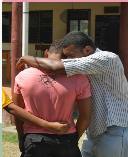
Brotherhood and intercessions at a recent camp