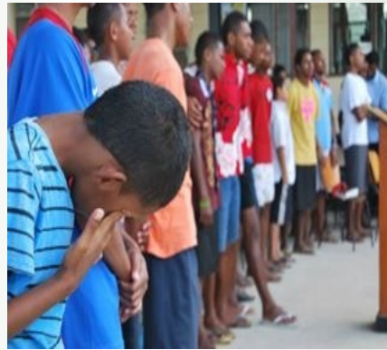
Repentance and reconnection with Christ was evident throughout the Western Camp as young people feel convicted by the Word and commit their lives to Jesus.