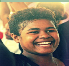
The smile says it all, after a powerful session at the recent SU Camp (left) and right, Japanese students were also part of the SU Western Camp.