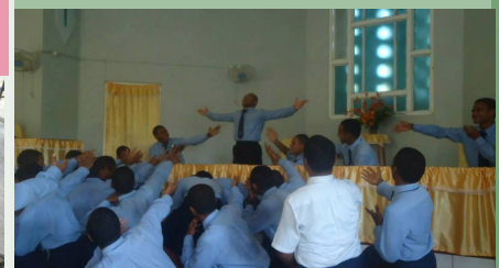
SUIS continued in most schools this month

"God is most glorified in us when we are most satisfied in Him" — John Piper