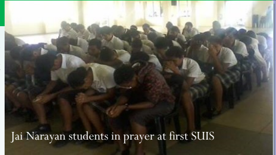
Jai Narayan students in prayer at first SUIS