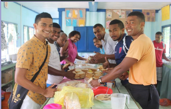
Members of the SWG serving students at Basden College at their first leadership training