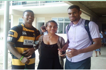
Volunteers above visit Nabua Secondary schools to join the students in their SUIS program