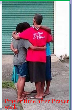
Prayer time after Prayer walk

know that the cost to be paid for the mission field in schools is not an easy one and they are beginning with this step of faith and intercession. They are believing that “closed” schools will open soon. Stay tuned.