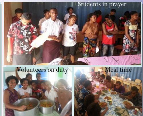
Students in prayer