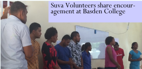
Suva Volunteers share encouragement at Basden College