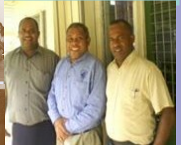
Teachers at Sila Secondary School after meeting ND to SUIS program at the school