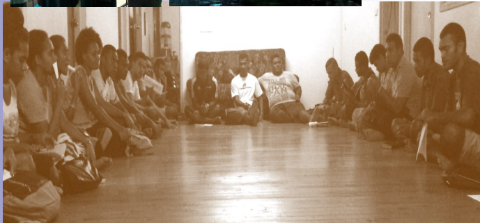
SWG Bible Study is held every Wednesday at the SU office from 7pm. More details on SWG Central Facebook