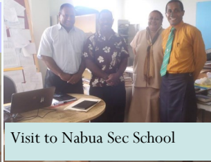
Visit to Nabua Sec School