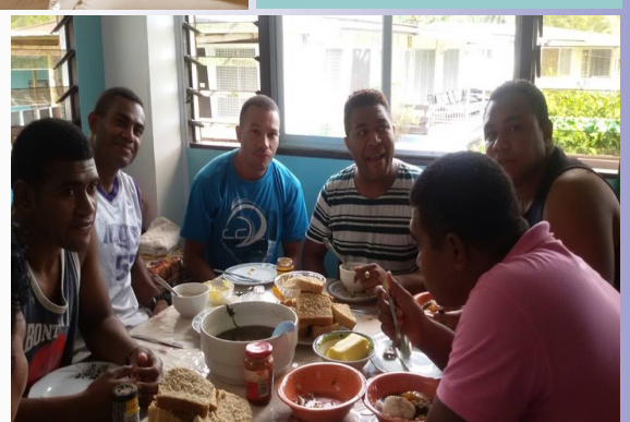
Western SU brothers with their Western Coordinator Pst Ralulu breaking bread and having morning fellowship as they discuss and share on the work in the Western Division