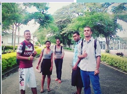
SWG Suva Zone 2 Volunteers visit the Suva Grammar School SUIS Group. See story of SGS Head boy on page 7