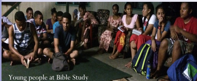
Young people at Bible Study