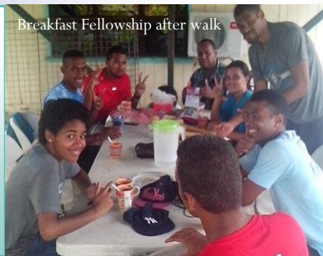
Breakfast Fellowship after walk

Suva Zone 2 leaders took a step of faith as they prayed for closed schools in Suva in a Prayer Walk on Saturday 28th of February. The prayer walk culminated in a breakfast fellowship of the leaders at the SU office. These young leaders