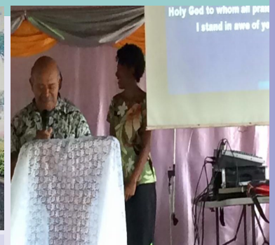
SU Ministry was invited to share to the Unity Baptist Church in Valelevu

“God is most glorified in us when we are most satisfied in Him” — John Piper