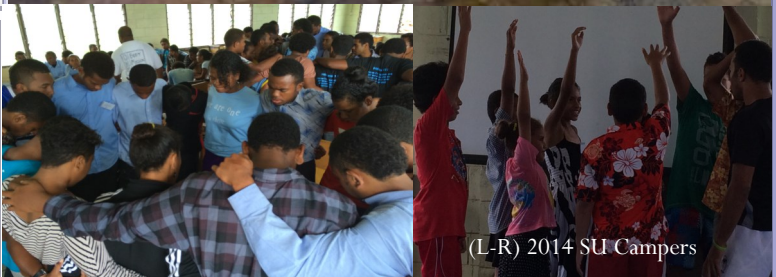
(L-R) 2014 SU Campers