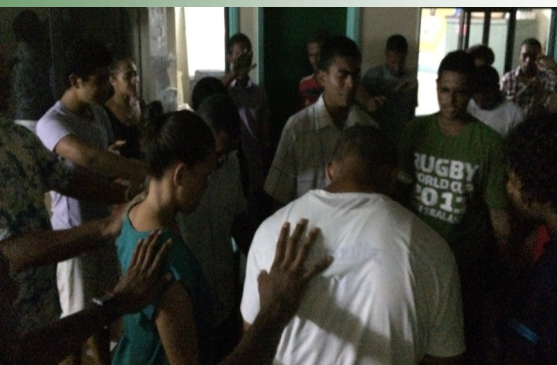
Volunteers took time out to pray for one another and their new leaders for 2015