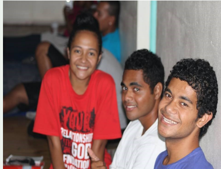
SWG Volunteers at their Planning Retreat earlier this month. The SWG have strategized on how to coordinate their schools visitation program, planned their projects for this year as well as discussed spiritually encouraging programs also for them this year.