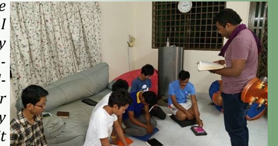
Sharing the Word at a Home Fellowship