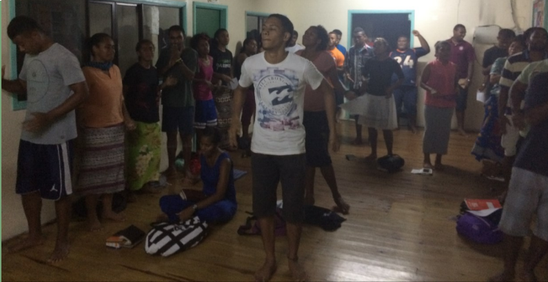
Volunteers in praise and worship at their first Bible Study for the Year. They shared on being Fishers of Men from Luke 5. The attendees then had time to align themselves t God's purposes for them