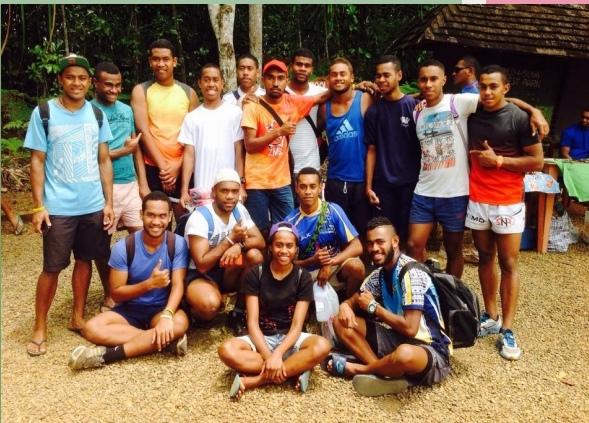
Campers continued their fellowships in December with a hike and a fellowship time at the Colo I Suva forest park.