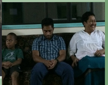
Guests at the Basket Tea fellowship

"God is most glorified in us when we are most satisfied in Him" — John Piper