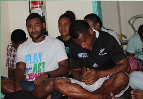
Members of the SWG at the Elections of their leaders; Jan 2015