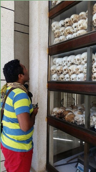
Skulls of those murdered at the Killing Fields .

Cambodia is a country reeling from the genocide that took place in that country between 1975-1979. During this period, between 1.7 to 2.5 Cambodians were brutally murdered by the Communist Khmer Rouge regime in their attempt to