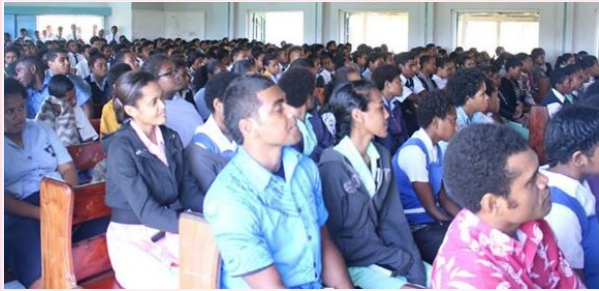
Term 1 (above) and Term 2 (below) rallies in 2014