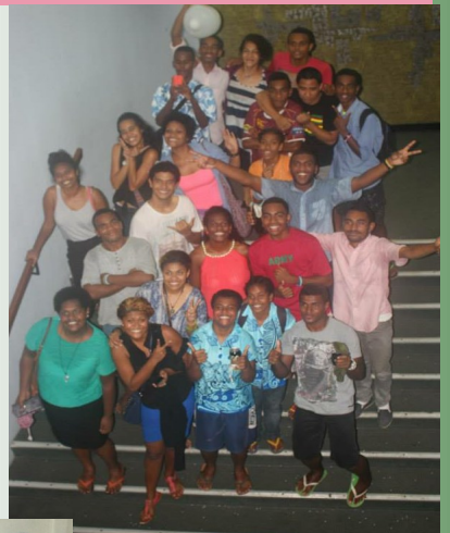
SUIS Campers continued their fellowship to the Syngery Fellowship in Suva