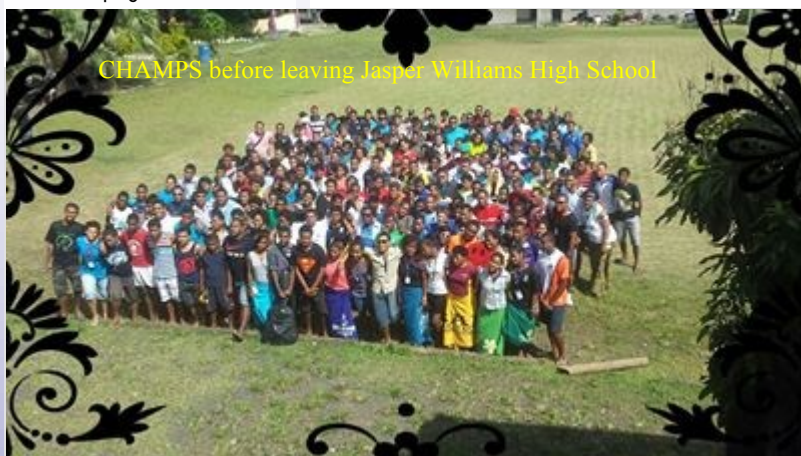
CHAMPS before leaving Jasper Williams High School

It was a camp with a difference, as hundreds of students converged at Jasper Williams High School, Lautoka for the Annual Scripture Union Camp. Most came expecting, some were there because they wanted to experience a camp and the rest, let's just say it was out of curiosity, but the amazing part about camp was that our campers left Lautoka, refreshed, energized and deeply touched by the Word, friendships and little nuggets of discovery about themselves through the Word of God. The messages focused on the