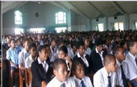
QVS 1st Term Rally, March 2013 (Photo 5-6)