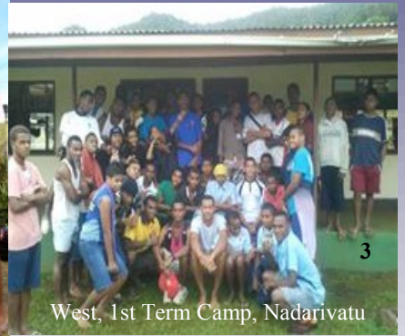
West, 1st Term Camp, Nadarivatu