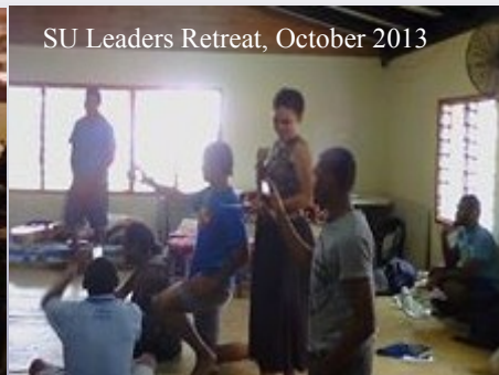
SU Leaders Retreat, October 2013