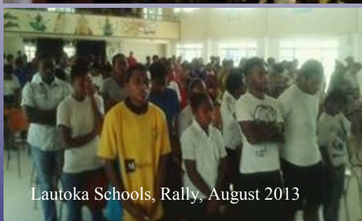
Lautoka Schools, Rally, August 2013