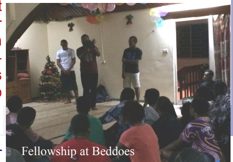
Fellowship at Beddoes