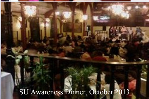
SU Awareness Dinner, October 2013