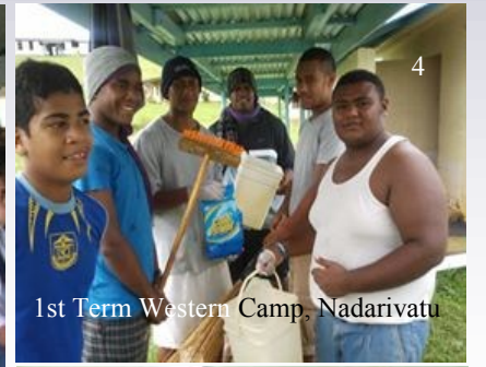
1st Term Western Camp, Nadarivatu