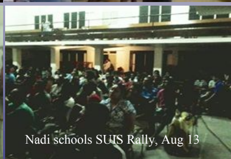
Nadi schools SUIS Rally, Aug 13