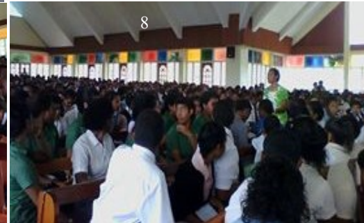
RKS 2nd Term Rally, July 2013 (Photo 7-8)