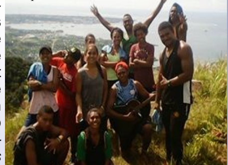
Top of the Mt Korobaba

top of the mountain, but yeah...I was looking all around me, looking at His creation, stoked that the same God that created heaven and earth, is the same God that welcomes me back in His arms each time I run back to Him and we'll never understand His love and grace but all we can do is just say thank you "