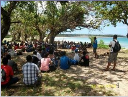
2012 Campers Reunion: Jan 2013 (1-2)