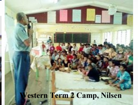
Western Term 2 Camp, Nilsen