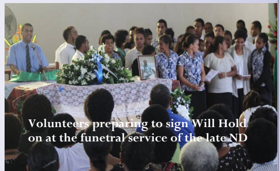
Volunteers preparing to sign Will Hold on at the funeral service of the late ND

sang the song at the Nadera Methodist Church, the lyrics came alive as it was singing the life of the late National Director who seems to be reminding the ministry he served and loved to Hold On, no matter the storms to the Rock, Jesus Christ. What a tribute.