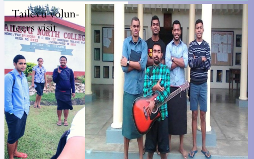
Tailevu volunteers visit QVS SUIS

Deuteronomy 15:10—Give generously to him and do so without a grudging heart; then because of this the Lord your God will bless you in all your work and in everything you put your hand to.