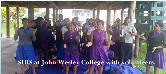
SUIIS at John Wesley College with volunteers.

The SU Volunteers continued their visitations this month with schools in the Suva-Nausori and Tailevu corridors hosting the volunteers at their respective SUIIS groups. The volunteers ministry includes either