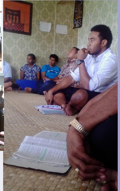
Volunteers doing a bible study and encouragement session at their retreat in Ba. See story at Page 3. Bible studies are also a weekly feature of the Volunteers program. See page 3 for more stories.