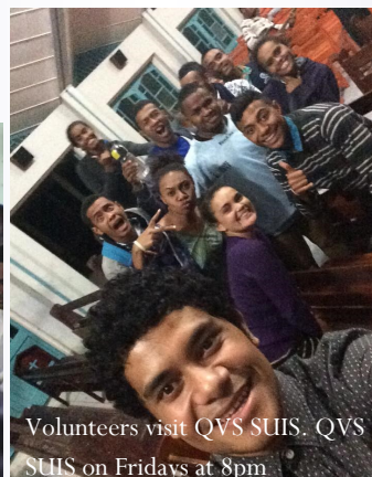
Volunteers visit QVS SUIS. QVS SUIS on Fridays at 8pm