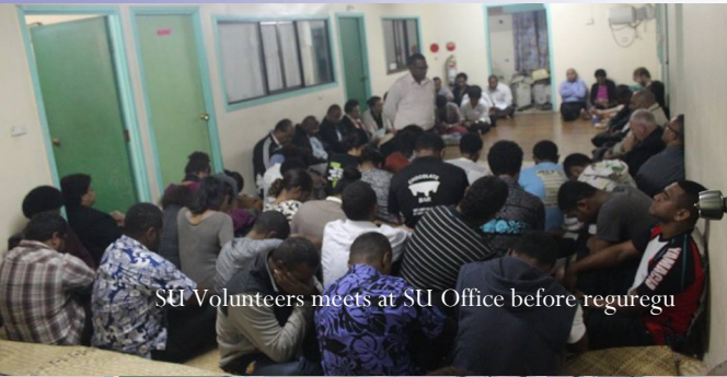
SU Volunteers meets at SU Office before reguregu