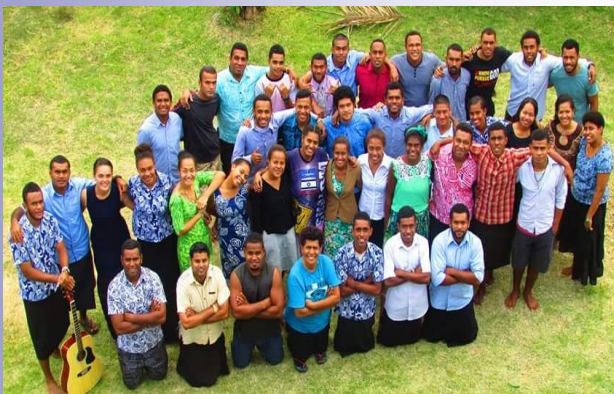
Volunteers at their Retreat in Ba at the end of this month. It was a refreshing time for them and the volunteers returned from the retreat energised.