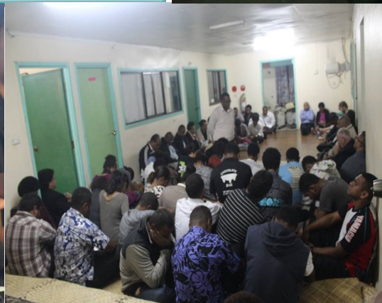
Chairman of Trustees briefs SU Family on funeral plans