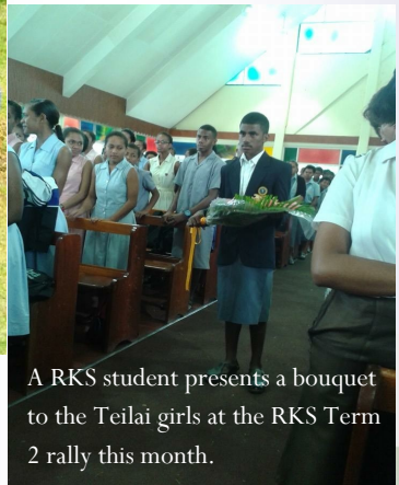
A RKS student presents a bouquet to the Teilai girls at the RKS Term 2 rally this month.