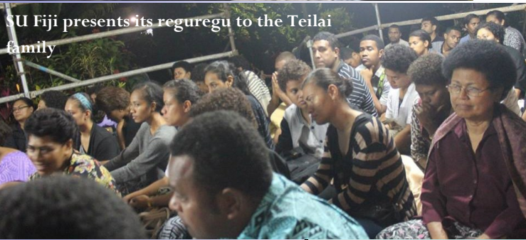
SU Fiji presents its reguregu to the Teilai family