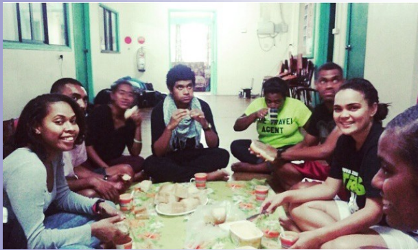
Volunteers at the SU Office having late night tea and waiting for their retreat in Ba at the end of this month.