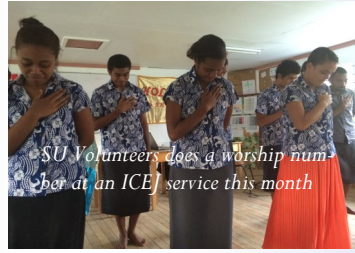
SU Volunteers does a worship number at an ICEJ service this month