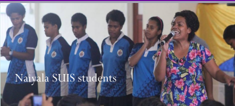
Naiyala SUIS students

RKS was a sea of colours as students from about 15 secondary schools attended the Term 2 Central-Eastern rally. The rally was about bringing students from schools together to share in fellowship and in the Word. Students from Naiyala inspired the attendees with a powerful challenge about putting their trust in God while the ACS girls shared a drama and an action song themed around the importance of making right choices