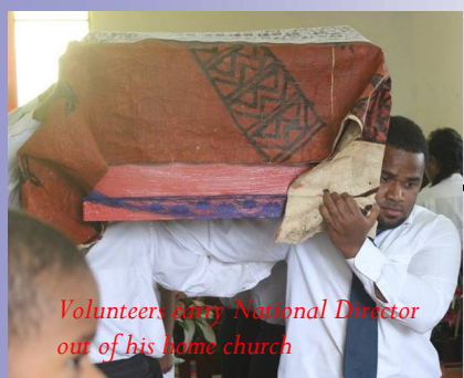
Volunteers carry National Director out of his home church