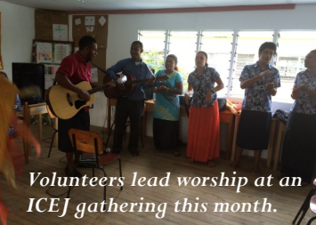
Volunteers lead worship at an ICEJ gathering this month.