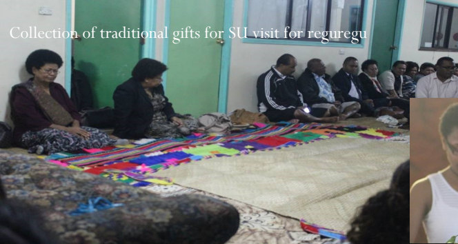
Collection of traditional gifts for SU visit for reguregu