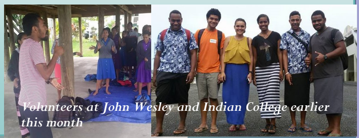
Volunteers at John Wesley and Indian College earlier this month