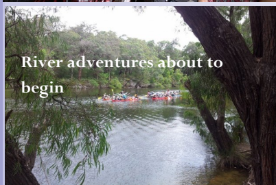
River adventures about to begin

cause it was outdoors and very adventurous and plus we all slept in tents and we took our food ration for 1 week with us! we also built our rafts with our team and transported all our gears on the raft to the different locations for our pit stop for the day!" Benji said. Further Benji was able to lead a group of young men to Christ. "I led 7 out of 10 of my boys to the Lord through this wonderful Outdoor camp. That is my highlight of the whole Rafting Camp and I thank God for bringing me to Western Australia for these boys" Benji said. Since