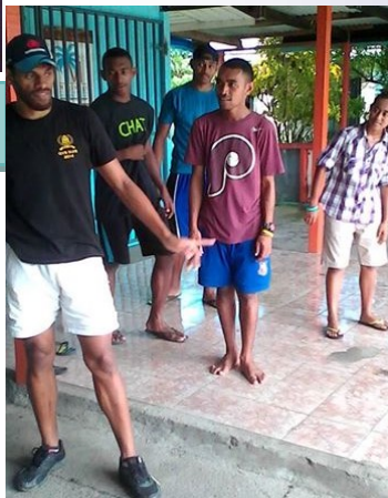
Suva Zone 2 leaders learning item preparing for the Youth-Nighted event scheduled for the closing night of the Coke Games next month. The Youth Nighted is SU's main outreach program for secondary school students on the night of the biggest athletics game in Fiji. In 2014, the volunteers staged the first Flashmob that was shown to all of Fiji TV's viewers.