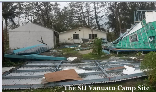
The SU Vanuatu Camp Site

Tropical Cyclone spared a few Pacific Countries including ours from a devastation that could have costed us much, however for our neighbouring countries of Kiribati, and Tuvalu, the impact of the adverse weather was clearly visible. For our brothers and sisters in Vanuatu, the destruction caused by the cyclone was devastating. Part of the huge damage on infrastructures was on the Scripture Union Vanuatu's camp site. Though there were