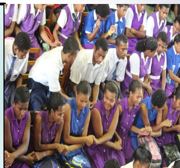
Suva schools rally, term 1

"Forgiveness is a very foundational part of the Gospel of the Lord Jesus Christ"