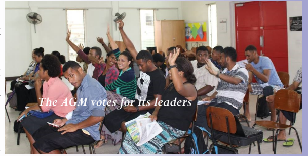
The AGM votes for its leaders