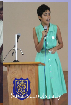
Suva schools rally