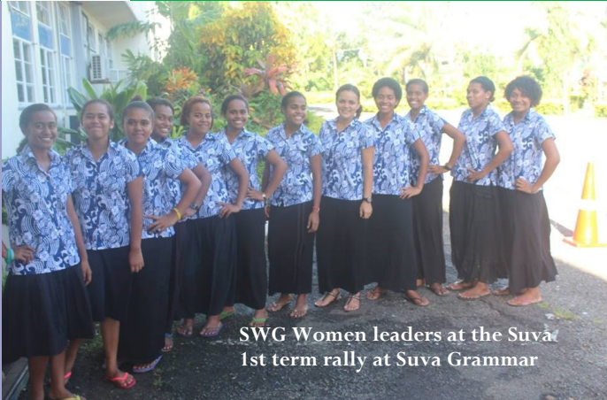
SWG Women leaders at the Suva 1st term rally at Suva Grammar