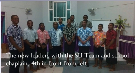
The new leaders with the SU Team and school chaplain, 4th in front from left.