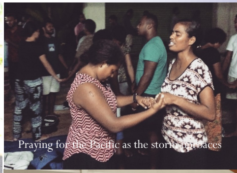
Praying for the Pacific as the storm brews