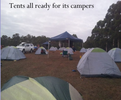
Tents all ready for its campers