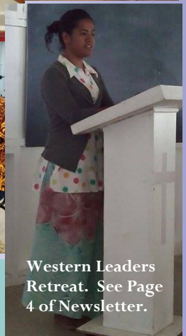
Western Leaders Retreat. See Page 4 of Newsletter.