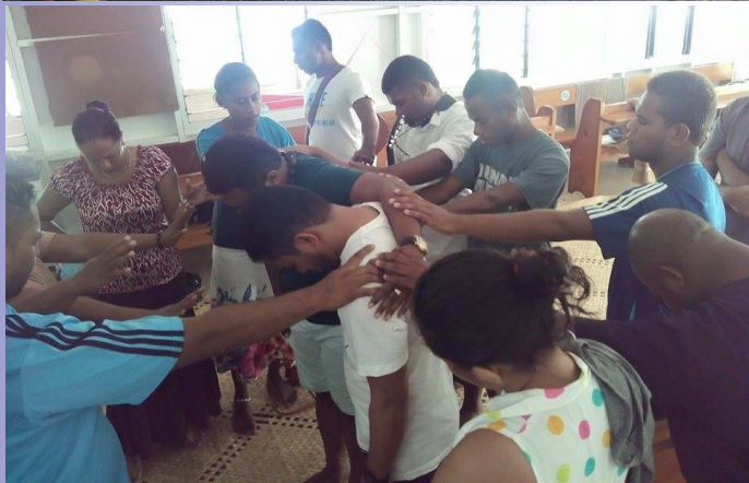
West Team at their Retreat. Seen here they praying for Bro Pate as he heads off to PNG. —see retreat story, Pg 4