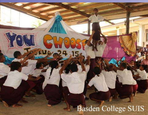
Basden College SUIIS

blies and gatherings in the name of God. "(AG, School Prayer Allowed, FBC News, March 12, 2014). We received with abated breath this wonderful news and answers to prayers during a brief period of uncertainly following the directive. We note that challenges as such will continue yet we are at peace knowing that God opens doors for opportunities and we must learn to trust Him daily. Since the clarification, we continued with our rally program and it was an Open Door as many students and schools who came voluntarily were blessed with the program and message for the day. As a family and young people focussed ministry, SU's doors remains open for opportunities to serve God. As a ministry and through our volunteers, we are recognised by the Fiji Teachers Registration Board as an institution that "may have skills and training to help students." We thank God for many open doors as we continue our outreach for His Cause. Until He opens the next doors, we remain in praises at the hallway. God is definitely Good—All the time.