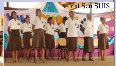
Yat Sen SUIIS