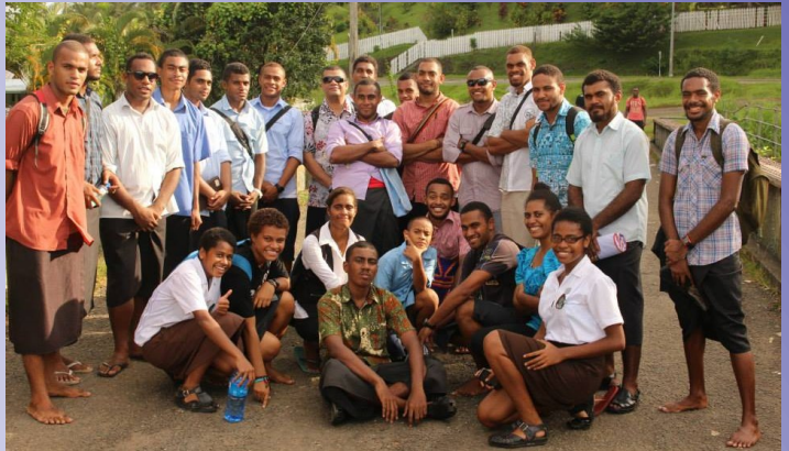
Some of our SWG Volunteers after the 1st term rally at Dilkusha High School takes a well-deserved break after the rally