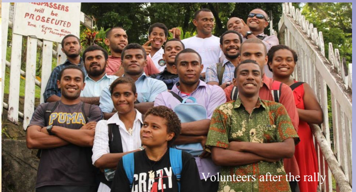
Volunteers after the rally

blies and gatherings in the name of God. "(AG, School Prayer Allowed, FBC News, March 12, 2014). We received with abated breath this wonderful news and answers to prayers during a brief period of uncertainly following the directive. We note that challenges as such will continue yet we are at peace knowing that God opens doors for opportunities and we must learn to trust Him daily. Since the clarification, we continued with our rally program and it was an Open Door as many students and schools who came voluntarily were blessed with the program and message for the day. As a family and young people focussed ministry, SU's doors remains open for opportunities to serve God. As a ministry and through our volunteers, we are recognised by the Fiji Teachers Registration Board as an institution that "may have skills and training to help students." We thank God for many open doors as we continue our outreach for His Cause. Until He opens the next doors, we remain in praises at the hallway. God is definitely Good—All the time.