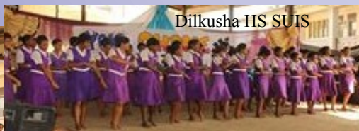
Dilkusha HS SUIIS