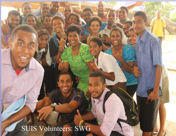
SUIIS Volunteers: SWG