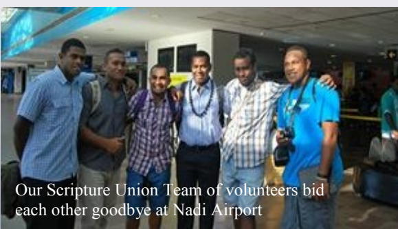
Our Scripture Union Team of volunteers bid each other goodbye at Nadi Airport

or lack of proper support. However it was their heart that caused them to pursue Christ wholeheartedly.