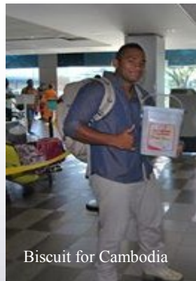
Biscuit for Cambodia