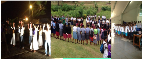
BE A FINANCIAL PARTNER OF

The pressure to raise children who know God through the Bible is not complete without introducing young people to the Lord Jesus Christ as personal Lord and Saviour. This is the work of Scripture Union in schools and despite the many financial challenges over the years, we hold onto this important part of our work and go into schools to minister to young people about making right choices in their