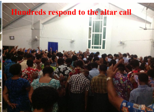
Hundreds respond to the altar call