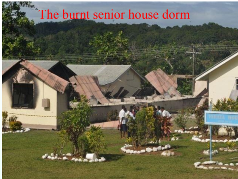
The burnt senior house dorm