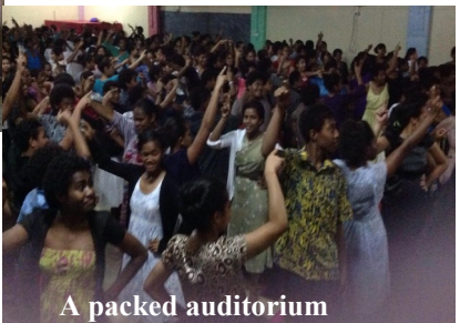
A packed auditorium

Members of the SWG were delighted to receive an invitation from the Deaconess of ACS inviting the SWG Team to come and lead the girls last SUIIS fellowship for the night. Held at the school hall, the sound of praise greeted the SUIIS team as they arrived at the gates of Adi Cakobau School on Sunday the 17th of November.