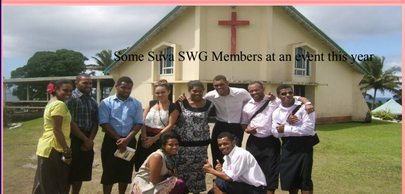
Some Suva SWG Members at an event this year

The School Working Group (SWG) are volunteers of SU. Comprising mostly of young adults, most were members of SUIS at high school and now are at tertiary institutions (USP, FNU, U o F) or working and come back to give to Scripture Union their time, talents and resources. Every year SWG grows and changes as some move on and other new faces join the group. The SWG is often described as the backbone of the ministry as they complement and support our programs in schools and through the public. These dynamic young men and women are encouraged and inspired to be role models to students in their lifestyle, purity and leadership.