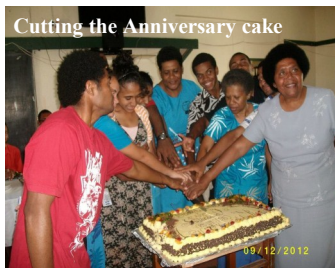
Cutting the Anniversary cake

There are spiritual giants amongst others and many others who have gone before us. Our common factor is our service and love for King Jesus and SU has witnessed this in the 50 years of its existence in Fiji. Beginning in England as a call and a vision, SU came to our shores as part of a vision to keep encouraging the reading and study of the Bible in schools. Since then many of our finest and brightest continue to carry the baton to schools and raising the next generation of Spiritual giants. It is our 50 years and more of testimonies