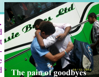
The pain of goodbyes

Many young people are trying to find meaning in their lives. There are a lot of options out there in the world. Music, entertainment, fame, sports and the whole range. Often at our camps (and this camp was no difference, students are reminded of their real worth. 2000 years ago on a cross, our worth was displayed for all to see, our Creator God, dying on the cross to redeem us from the evils and bondages of sin and death. For the many young people coming to camp, this is not a place for them to find religion, but to experience God. We not only meet new people when we march into camp, but for many they make lifelong friends. The pain of good-byes after the camp is made easy knowing that one day we shall be with King Jesus in eternity.