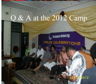
Q & A at the 2012 Camp