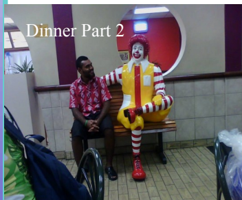
Dinner Part 2

faith seed of our financial partners that has seen us continue our work in schools. Even as we went through our "drought seasons" we were optimistic that this work is too important to be dictated by our negative bank account. To take the easy way out was to just close shop and let the churches take over or let the schools decide for themselves whether they want Christian Fellowship programs to operate. But it is for His Cause, through the vision of SU in sharing the Word of God to all students and their families that keeps us motivated to pray, seek funds and ensure that our doors remain open to serve children and families in Fiji through encouraging them to read the Bible and get to personally experience and know this Almighty and All Sufficient God of the Bible. And so the dinner was really about sharing about the work of SU in schools and also to encourage people to partner with us in this Great Commission we have in schools. The people that came, gave graciously to support our mission in schools. The dinner raised $1750 to support SU and we are extremely grateful for this heart of giving.