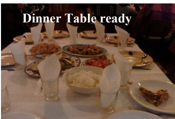
Dinner Table ready

our source and strength and through this experience, God reminds us that He is still our Jehovah Jaire —the Lord our Provider. This newsletter is titled Faith Seed simply because it has been the