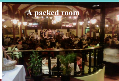
A packed room

court case and we are continuing to strengthen our mission work in schools and meeting our financial commitments. Despite our financial struggles, we have continued to look to King Jesus