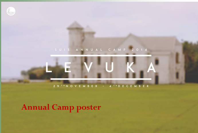
Annual Camp poster

Destination: Saint Johns College, Levuka, Ovalau will host the 2014 Annual Camp. The