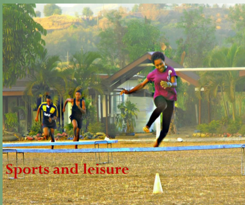
Sports and leisure