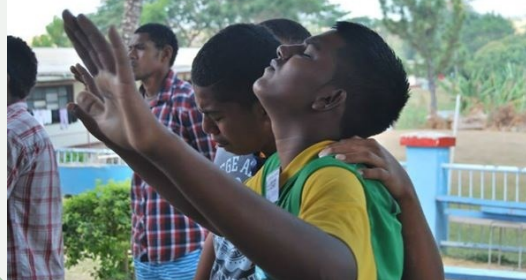
Praise and Worship