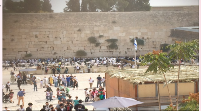
Western Wall or the Wailing Wall in Jerusalem