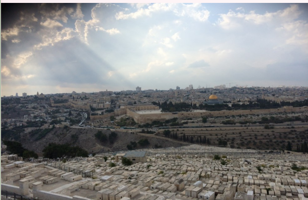
From the Mount of Olives looking into the Old City of David