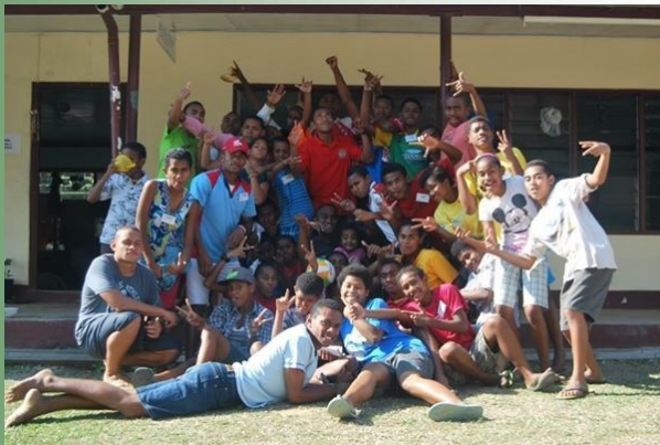
Various Policies like Child Protection Policy is targeted towards protecting children attending our events.

Like any organisation, Scripture Union continues to evolve. With over 50 years of ministry presence in Fiji, we must adapt, pray and believe that God is giving us a new vision for our work in the next 50 years. Otherwise, we risk being relevant in a fast changing environment. Young children today are often termed the technology generation, Generation X, and a few other adjectives that best describe our generation. And so the challenge of ministry includes responding to the demands of a generation whose exposures to a circular world is way different from that most of us encountered growing up. Further SU as a ministry has gone through a lot of challenges in terms of its own organisation. The current Council is picking up from the previous efforts and work done by its predecessors in an