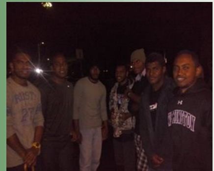
Let brotherly love continue. SWG Boys attending Synergy in Suva